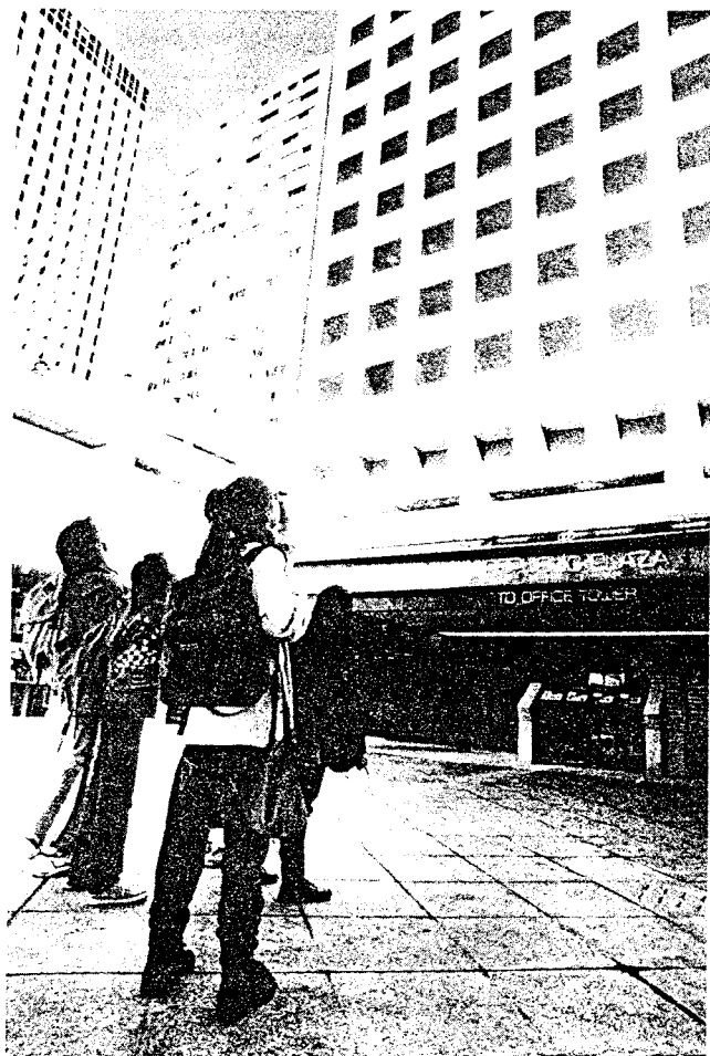
Students from the Rocky Mountain School of Expeditionary Learning in Denver explore their city.

compassionate community might someday be realized on a worldwide scale, people are not inclined to live on humane terms with one another.