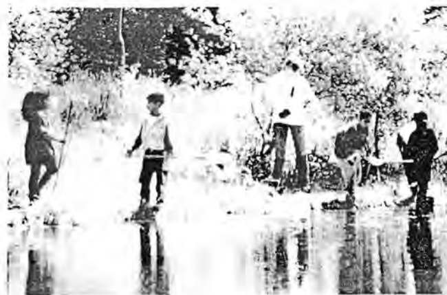
Students from the Rafael Hernandez Bilingual School in Boston observe and document wildlife for a learning expedition on pond life.

Beginning in the early 1970s, Project Adventure, an offshoot of Outward Bound started by instructors wishing to work more closely with conventional schools, achieved success in applying experiential methods derived from Outward Bound to the schools. Project Adventure, which has been identified as an exemplary model by the National Diffusion Program of the U.S. Department of Education, went on to develop a repertoire of its own, paralleled by other creative offshoot programs, to assist in adventure programming, teacher training, and counseling.