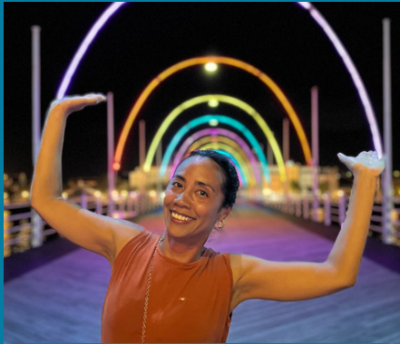
Senior Associate Director

As the Senior Associate Director of the Office of International Students and Scholars, I advise and support our visiting scholars, J-1 exchange visitors, and F-1 students. When I'm not wearing my OISS hat, I enjoy watching horror films and Japanese TV dramas, researching airplane routes, watching the take-off and landing of airplanes, kickboxing, and kyudo.