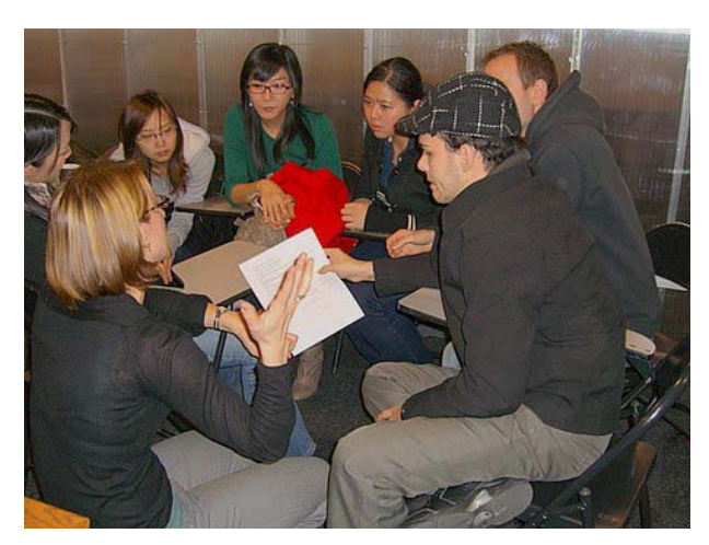
LaGuardia students participate in a lesson

Innovation is the name of the game for Teachers College alumni working in the English Language Center (TELC) of LaGuardia Community College in Long Island City.