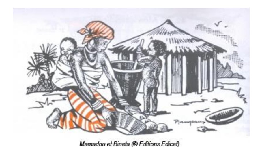
Figure 2. Mother cooking with children. (Editions Edicef, 2015)

At the same time, the next depiction, from an ACR reading book in Wolof for children to take home for practicing reading, is gender transformative, with a girl and boy shown washing dishes together. This illustration shows how gender roles can be transformed so that chores at home are shared. When this sharing happens, the time of girls is not disproportionately placed into domestic tasks; then, they can both practice reading and take part in free play, which boys traditionally have more time to do. Sharing the domestic chores can transform the gender structure, which has ripples into each aspect of a child's day and life cycle.