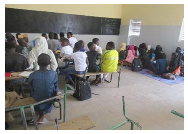
Figure 1: Daara (Koranic school) early primary classroom, Senegal. (Diop, 2019)

Improve textbooks to eliminate or reduce women, men, boys and girls being depicted in sex-stereotyped ways. Findings of a 2015 UNESCO study indicate that gender bias in textbooks is a serious issue: "Textbooks and curricula matter not only for learning new information but also for what perceptions they create about women and their roles" with "study after study showing significant gender bias in textbooks, with women greatly underrepresented and both women and men depicted in gender-stereotyped ways" (Sperling and Winthrop, 2016, p. 254). Studies from developing and developed countries find that females tend to be greatly underrepresented, and both males and females are depicted in gender-stereotyped ways. A recent textbook in Senegal included a text that perpetuated harmful gender norms, suggesting that boys should help their fathers in the fields and girls should help their mothers at home.