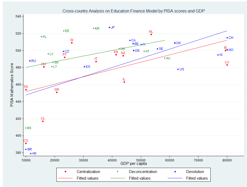
Figure 1. Cross-country Analysis on Education Finance Model by PISA scores and GDP per capita

Note: GDP per capita in Figure 1 were top-coded with a range of (10,000-80,000) USD, and the value of seven countries were adopted accordingly. Country codes are available in Appendix A. Source: UN Statistics Division (2020b), World Bank (2020), and author's calculation based on OECD (2019) Education at a Glance 2019 , Figure C4.3., Welsh & Shah (2006).